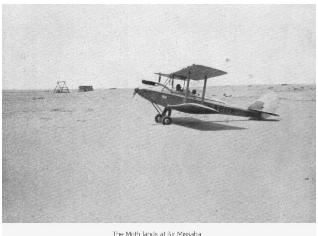
The Moth lands at Bir Missaha